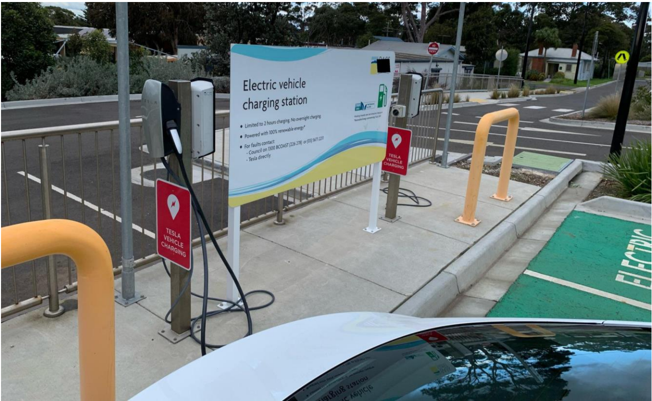
Figure 39: eV charging station at Cowes