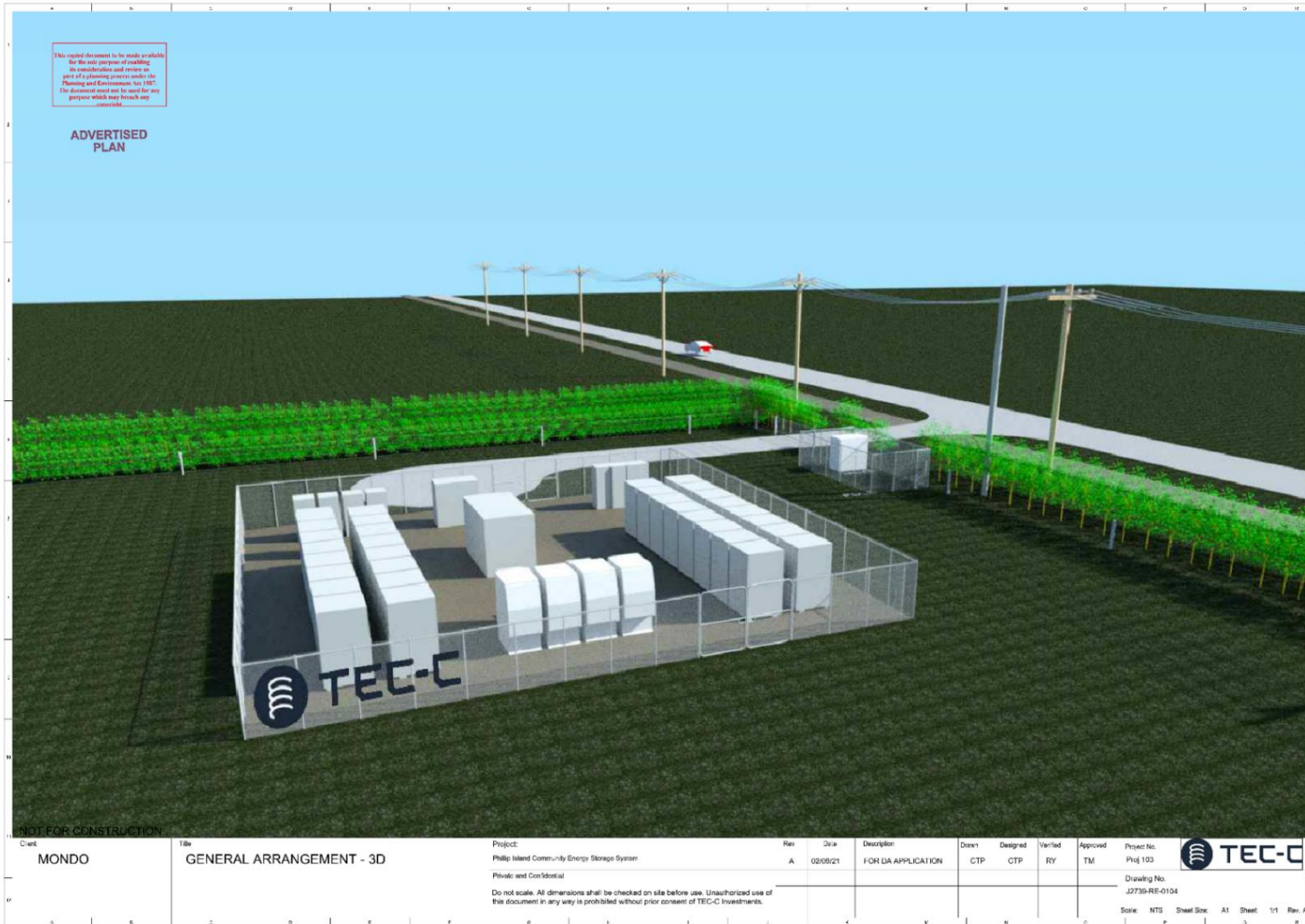
Figure 41: PICESS battery 3D model

Document name: Solar Opportunities Report Document no: P22067-G-RPT-0001 Revision no: 0