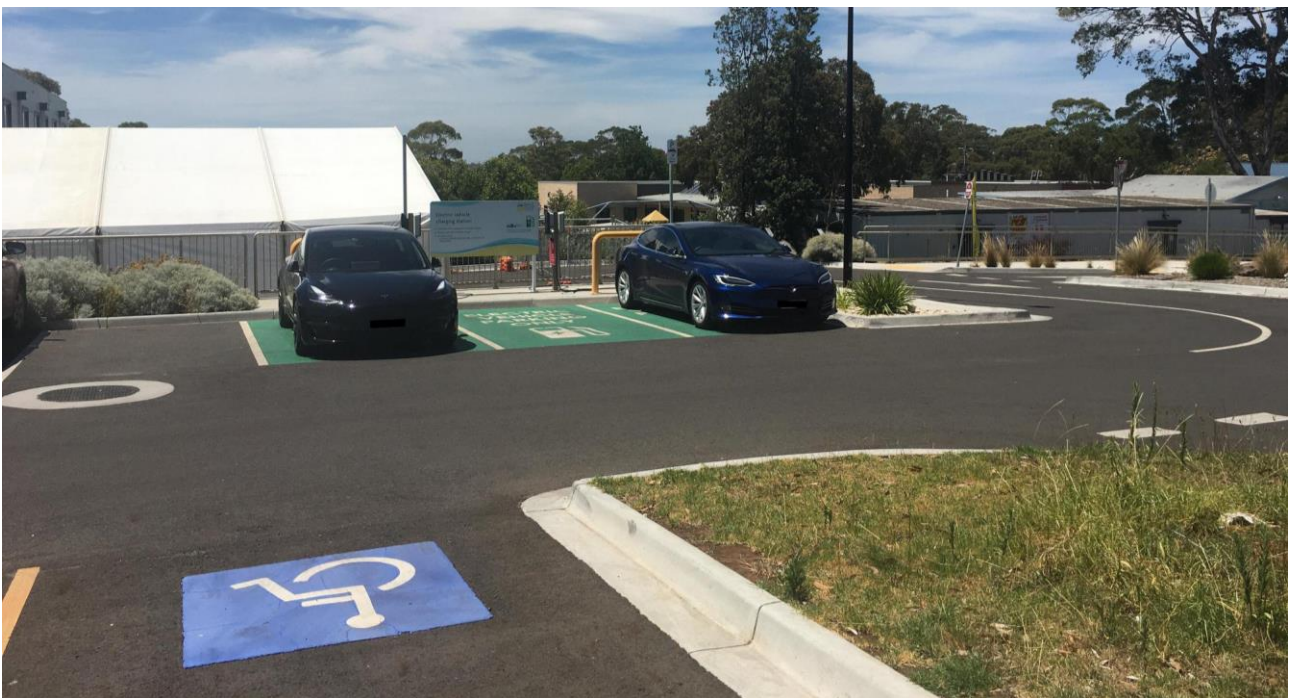
Figure 40: eV charging parking area at Cowes